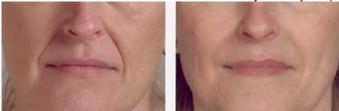
Before Restylane After Restylane

Can also be used to rejuvenate your lips