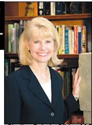
Shelley Sekula Gibbs, M.D.