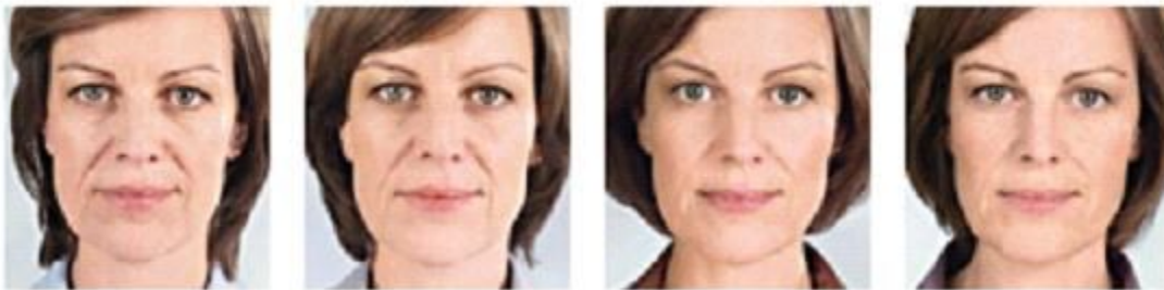
Before Sculptra After Treatment 1 After Treatment 2 After Treatment 3

Sculptra Aesthetic® Facial injectable that can last up to 2 years restores volume