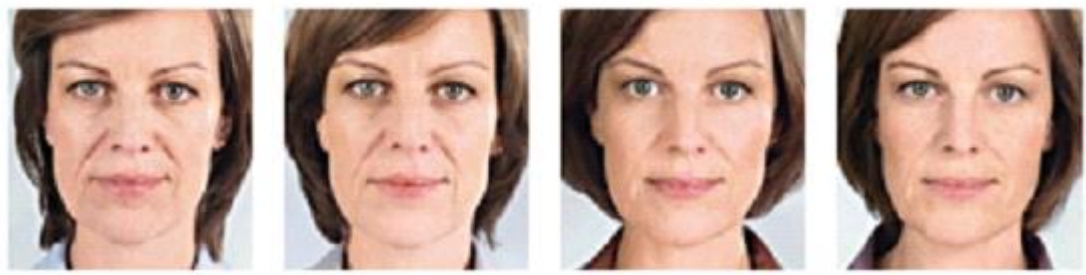
Before Sculptra After Treatment 1 After Treatment 2 After Treatment 3

Sculptra Aesthetic® Facial injectable that can last up to 2 years restores volume