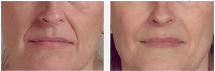
Before Restylane After Restylane

Can also be used to rejuvenate your lips